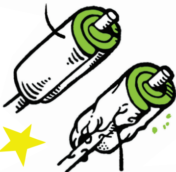
Damaged Myelin Sheath