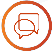
SPEECH/ LANGUAGE PATHOLOGIST