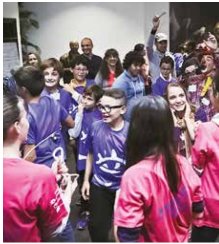
France: An information day for children with MS and their families.

Although MS will sometimes make certain sports or activities more difficult, children with MS should not feel they need to stop being active and rest all the time.