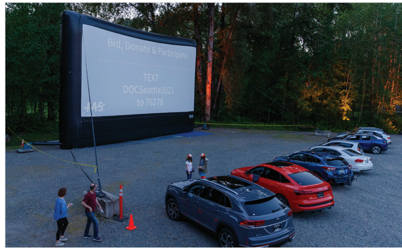
Dinner of Champions, drive-in event

and our fundraising events this spring offering both virtual and in-person options for participation.